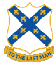
103 rd Regimental Crest

Displays will be set up consisting of company rosters, campaign maps, photos and other historical items. Light refreshments will also be served.