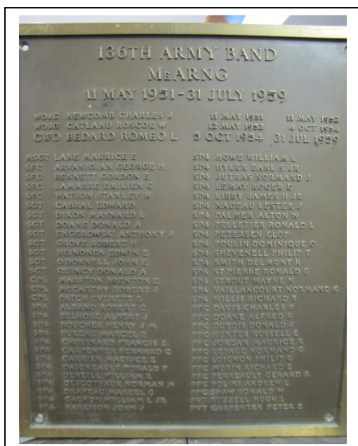
136 th Bronze Plaque

If you do, ask them to visit our museum and say hello. We would enjoy having them as members of the MMHS. If you do know the answers to these questions, please send them in for the next edition of the Patriot News.