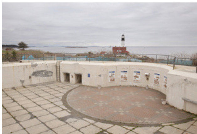
Battery Blair at Ft Williams, Cape Elizabeth, Maine

Visit www.mainemilmuseum.org for updates.